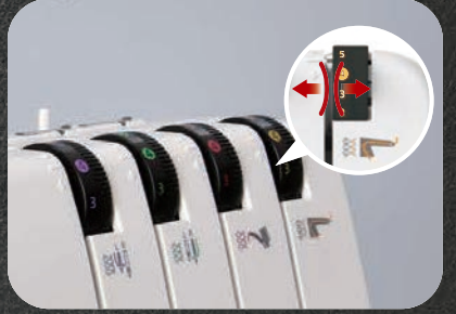
Auto tension release