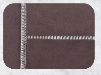
3-Thread Flatlock Wide