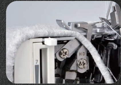
Durable cutting knife