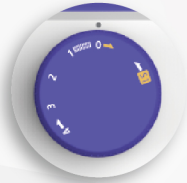
Variable Stitch Length (for 2 dials)