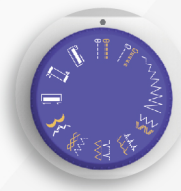
Easy Stitch Selection